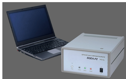
PC is not included.