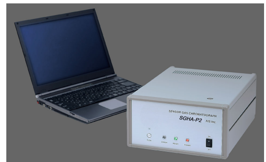
PC is not included.