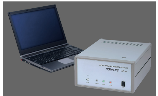
PC is not included.